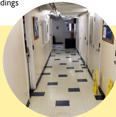
A hallway before...