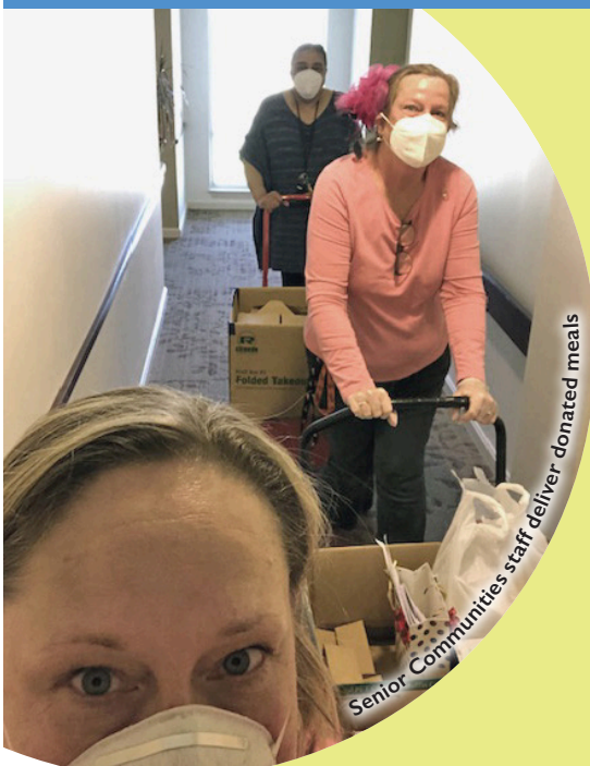
Senior Communities staff deliver donated meals