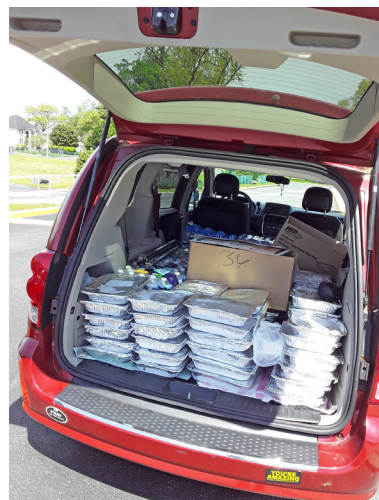
A trunkload of casseroles packed up and ready to go

To learn more, visit cc-md.org/covid19-donate