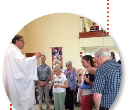
10:50 a.m. Jenkins Senior Living Campus

Volunteers and residents attend a worship service.