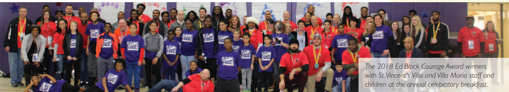
The 2018 Ed Block Courage Award winners with St. Vincent's Villa and Villa Maria staff and children at the annual celebratory breakfast.