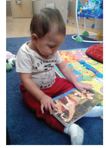
Books and babies: a natural fit at Catholic Charities Head Start

HOW TO HELP! Donate Pull-Ups, diapers and wipes, or serve as a classroom or administrative volunteer.