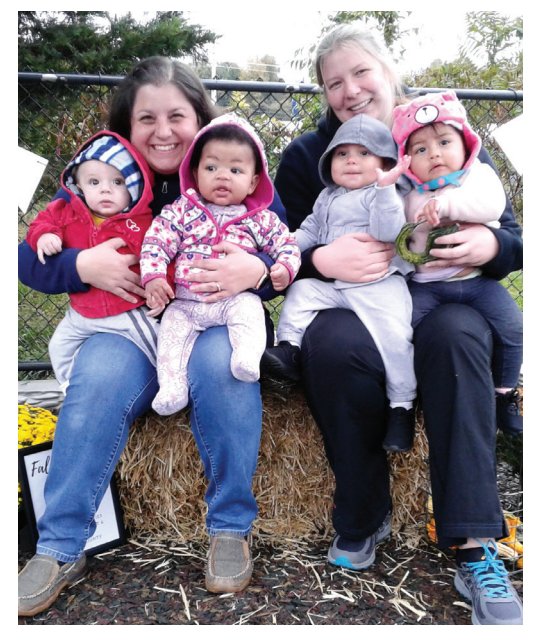
Carroll County Head Start celebrates fall