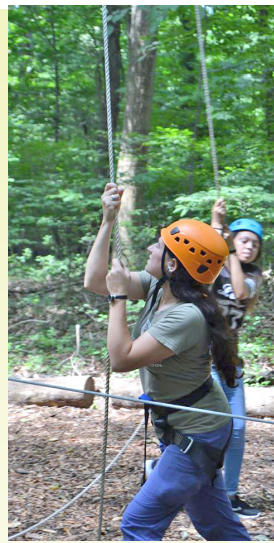
Students practicing skills to increase trust and communication.

High schoolers will participate in team-building and trust exercises designed to foster communication and understanding between police and young adults. Through a partnership between the Baltimore Police Department and the Baltimore Chesapeake Bay Outward Bound School in Leakin Park, the students meet officers and work with them to complete a range of challenges, including a high ropes course and climbing rock walls. ■