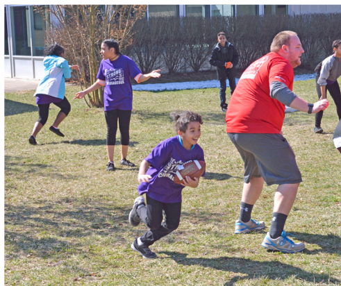
NFL players and St. Vincent's Villa's participants on the field.