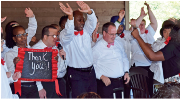
Gallagher residents wow guests with high-energy singing and dancing.

To learn more, visit cc-md.org/gallagher